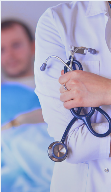
primary care physicians

This kind of program may involve a team of healthcare professionals, including